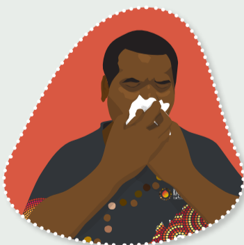
Cover your sneeze and cough